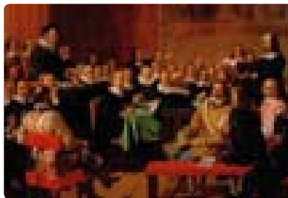
— WESTMINSTER ASSEMBLY —

teaching, study habits, and intellectual ability are one thing. What is truly indispensable for success at RBC, however, will be the sober-minded and joyful application of Christian graces to all teaching and learning.