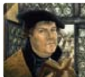
— MARTIN LUTHER —

is necessary for a mature knowledge of Scripture and a discerning engagement with the world, we focus on four areas: the content of Scripture, the system of doctrine taught in Scripture, the history of the church, and the great works of philosophy, literature, and music. We believe that our curriculum, with its emphasis on the coherence of biblical revelation and of the