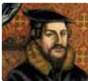
— JOHN CALVIN —

Because time is too precious for education based on historical novelties, RBC aspires to be a leader in providing education in the historic Christian faith and moral vision. Our undergraduate